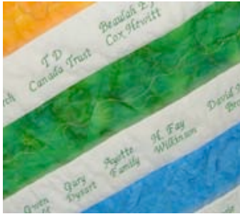
Close-up of the Heritage Quilt

of signature squares and almost $19,000 raised. The quilt is in the Cottage Dreams office in Haliburton if you would like to experience it or travelling around Ontario for various shows and fairs.